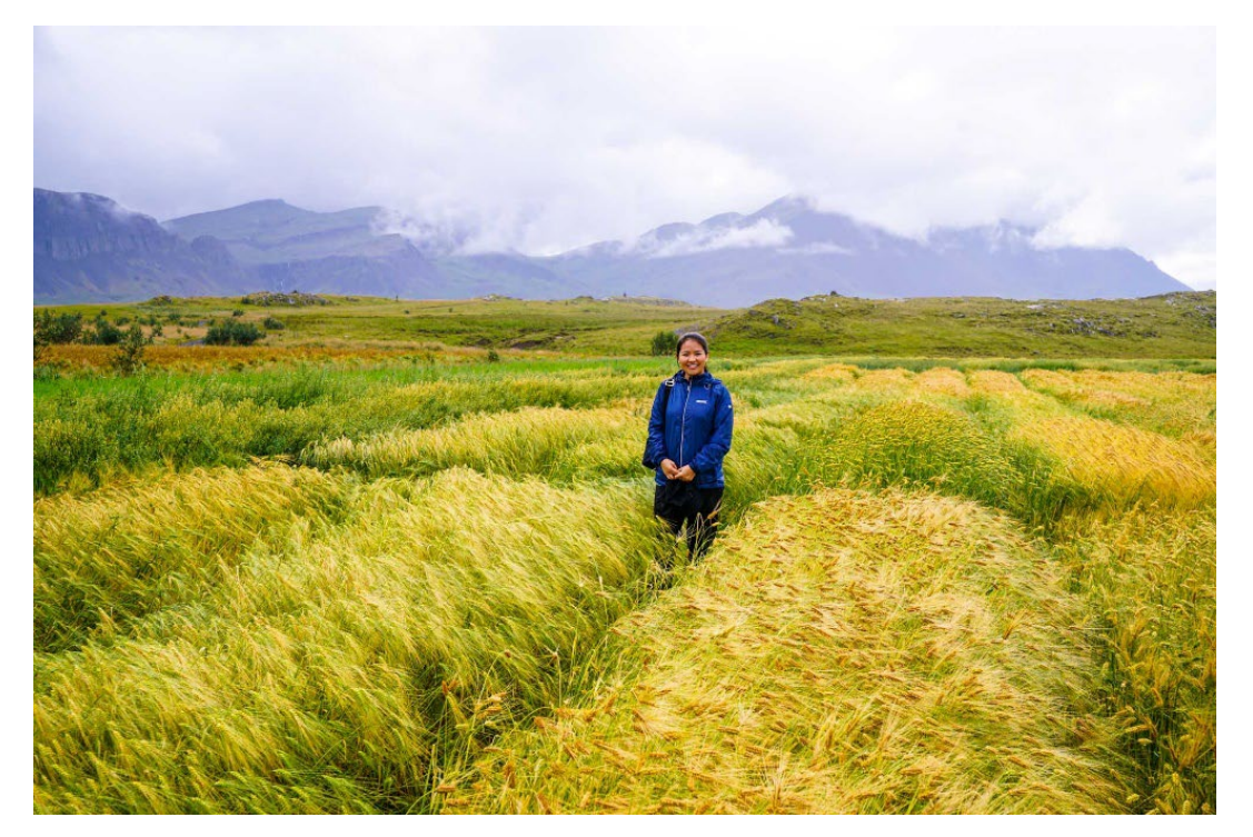
GRÓ LRT 2021 fellow Barkhas Badam from Mongolia at experimental plots at Hvanneyri.

The COVID-19 pandemic continued to affect the running of GRÓ LRT in 2021, though its impact was not as significant as in 2020. There were challenges regarding the processing of visa applications and in securing flights for the candidates travelling to Iceland to participate in the six-month training. One of the candidates had to cancel his participation in training at a late stage because of international travel restrictions in his home-country. The six-month training in 2021 started almost a month later than usually because of programme adjustments due COVID-19 and the overall time of the training programme was cut by two weeks. This meant some training sessions had to be held on weekends and public holidays, and one of the programme's eight modules was cancelled. Additionally, the GRÓ LRT in-country training courses in Mongolia and Uganda as well as visits to partner institutions were suspended again in 2021 because of COVID-19. Meetings with partners institutions and interviews with candidates for the 2022 six-month training were moved into the virtual space.