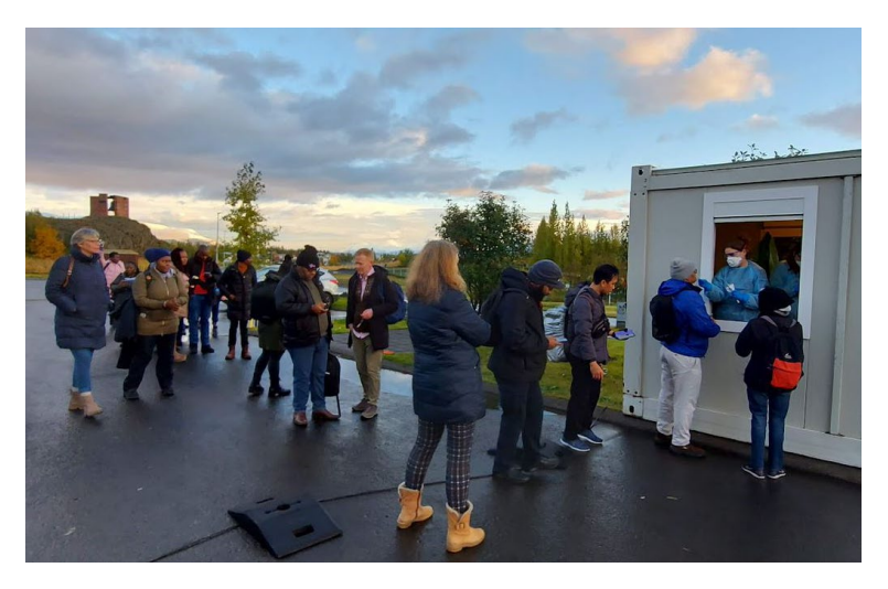
Fellows getting COVID tests in Akureyri during a field trip to northern Iceland.