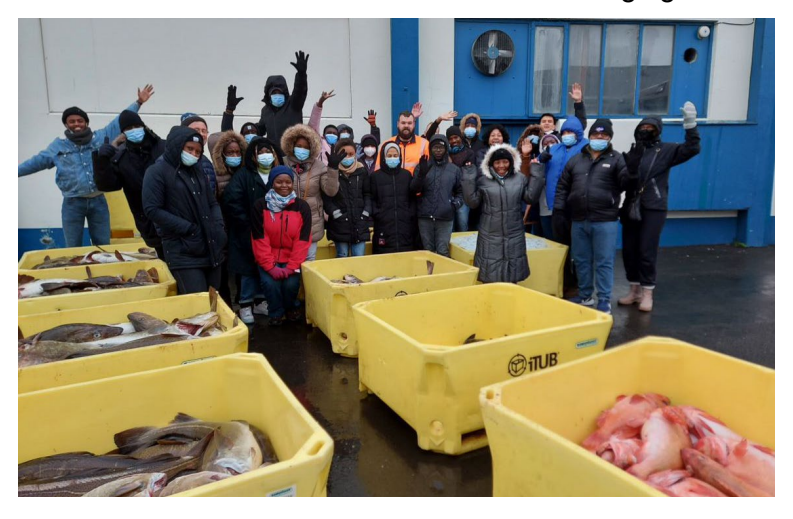
GRÓ FTP fellows at a fish auction market.

The first two years after the establishment of GRÓ have been heavily impacted by the Covid-19 pandemic. This time has been used to formalise rules and procedures for GRÓ's work, finalise services agreements with host institutions, improve financial accountability, create a joint GRÓ identity and platform and start to work on the future vision of GRÓ. The pandemic heavily impacted the GRÓ programmes in 2020. All the GRÓ programmes managed to receive fellows in 2021 and do much of the work they normally do despite all the travel restrictions, sanitation requirements, and many other challenges posed by the pandemic. This is due to great efforts and flexibility of the staff of the GRÓ Programmes and the fellows themselves, as is explained further in the report, and has provided GRÓ with many lessons learned on how to work in uncertain circumstances and in a changing environment.