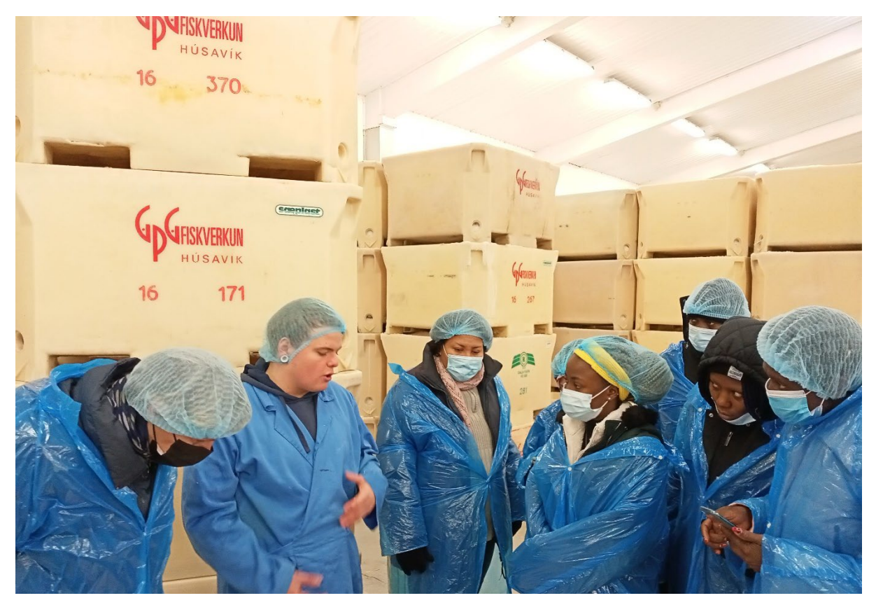
On a field trip in Húsavík.

The pandemic presented challenges for the logistics and administration of the Post-graduate training. While most of the incoming fellows were vaccinated, some were not and needed to quarantine for the first week. Fortunately, it was possible to stream the first week of courses via online platforms, so everyone could follow the lectures, even if they were in isolation at the time. The FTP is also extremely pleased that the companies they partner with were able to accept the group for site visits this year. Given the circumstances, the programme had anticipated many of the companies would not be able to welcome the group due to Covid-19 concerns. Fortunately, this was not the case, and several of the companies that are typically visited gladly and generously opened their doors to the group.