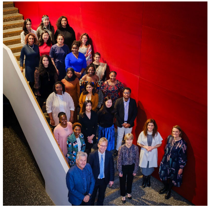
GRÓ GEST graduates of 2021.

GEST's teaching staff in 2021, i.e. module lecturers and final assignment supervisors, were nationals and residents of Uganda, Ghana, India, Lebanon, Denmark, Austria, the United Kingdom, United States of America and Iceland.