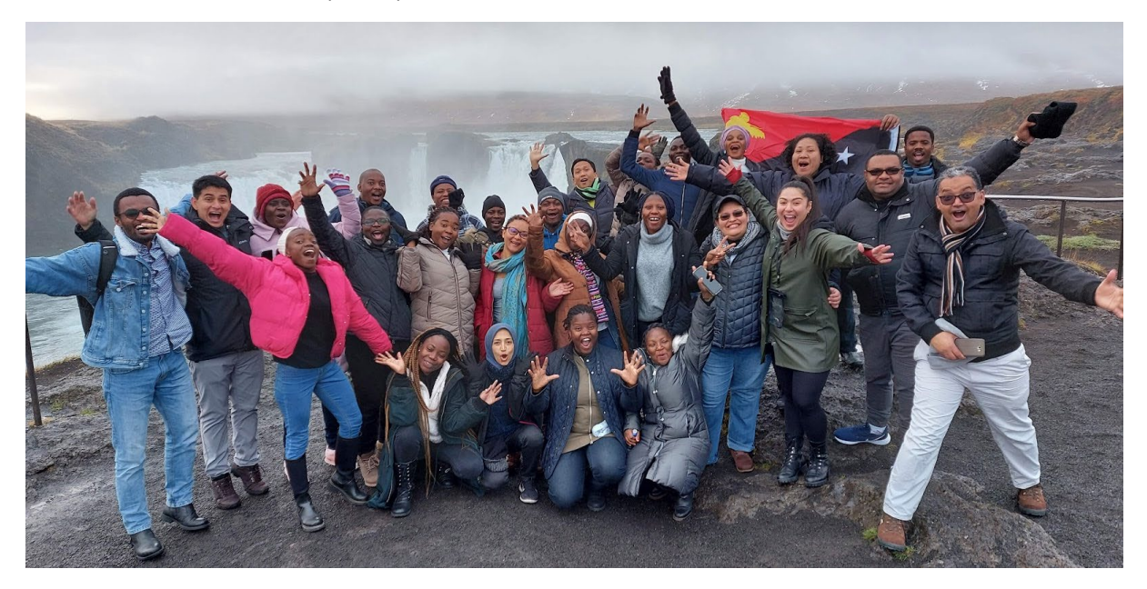
The 2021 cohort on a field trip in Northern Iceland.

The 2021 cohort of fellows was the largest the GRÓ FTP has hosted, with 28 fishery professionals from 17 countries. The group included 18 fellows from Africa, 12 from LDCs, and 4 from SIDS countries. The gender ratio in the group was equal, with 14 females and 14 males. Amongst the 28 fellows, 11 studied Fisheries Policy and Management (University of Akureyri), 7 the Aquatic Resource Assessment and Monitoring (Marine and Freshwater Research Institute), 6 the Quality Management of Food Handling and Processing (Matís) and 4 Sustainable Aquaculture (Hólar).