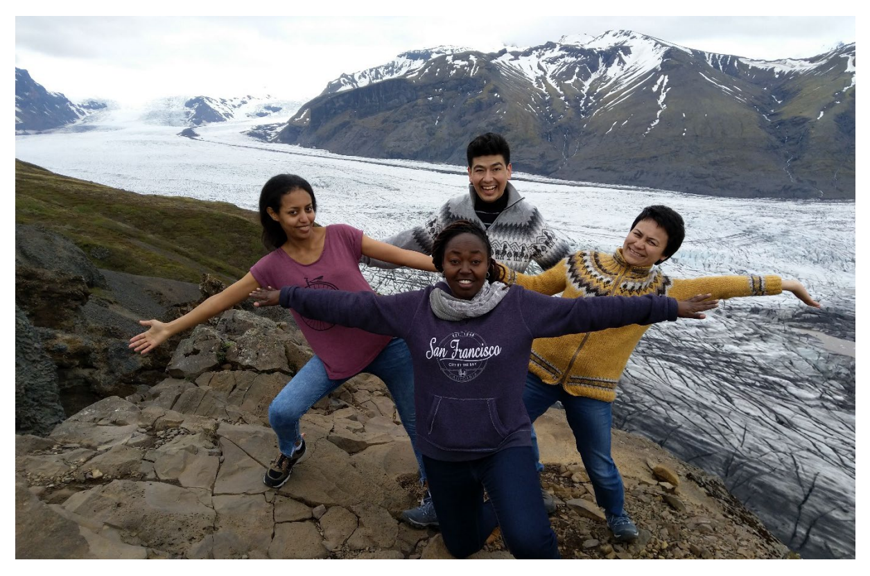
MSc and PhD fellows on an easter trip to celebrate release of lockdown in 2020.

The impact of COVID was quite dramatic, as was the rule for most human activity in 2020. The six-months training had to be postponed, mainly due to difficulties in acquiring visas and travelling, restrictions in home-countries and restrictions on travelling to Iceland and staying there. In addition, regular short courses in Kenya and El Salvador as well as the Geothermal Diploma Course in El Salvador were suspended.