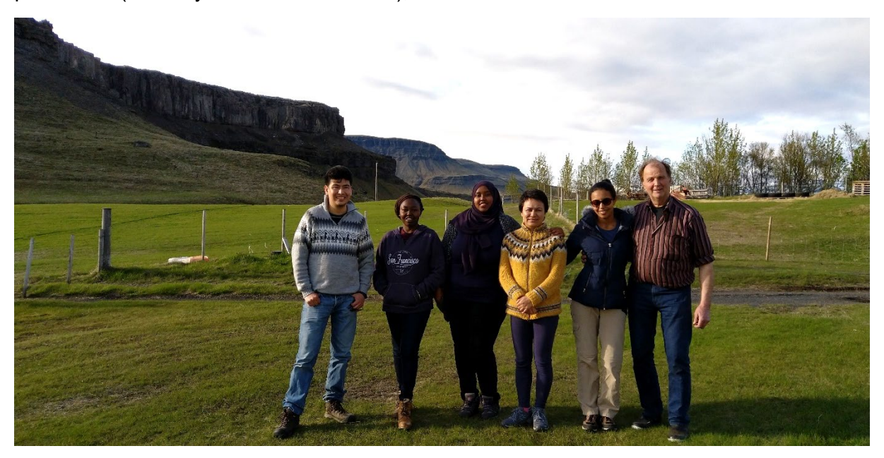
MSc and PhD fellows visiting their former landlord on his farm in east Iceland 2020.

In 2020 staff and supervisors reviewed/edited project reports of the 2019 six-month fellows for publication (annual yearbook and website), see item 6 below.