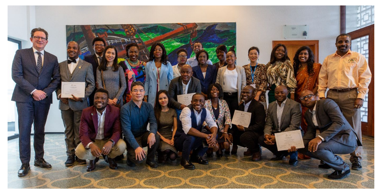
The last group of FTP fellows to graduate before Covid-19 suspension of programme pictured with Kristján Þór Júlíusson, Minister of Fisheries and Agriculture, at graduation in February 2020.

Due to Covid-19 it was not possible to invite the next group of fellows to participate in the sixmonth programme in 2020. This intake was delayed for one calendar year.