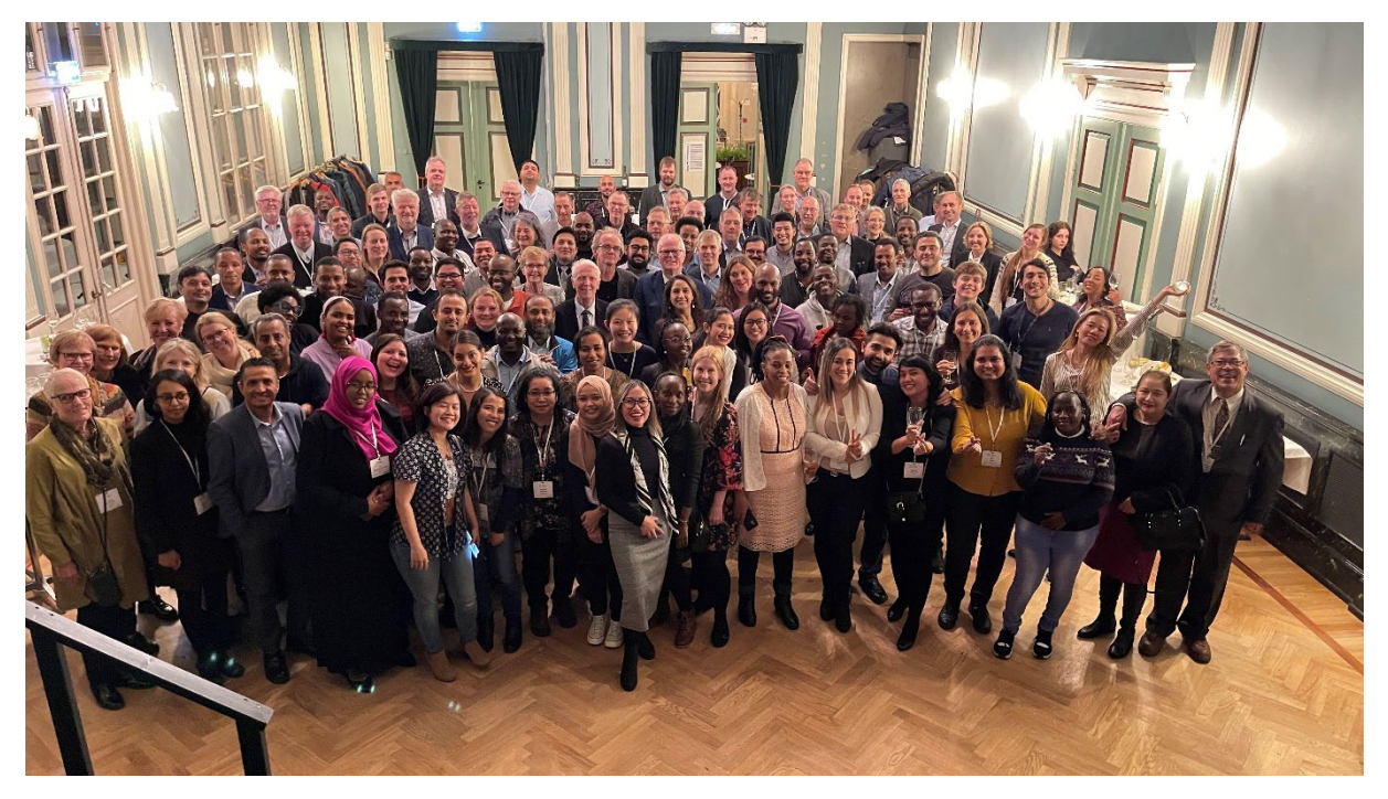
GTP Fellows reunion at the World Geothermal Congress in Iceland in 2021.

The recent affiliation with UNESCO provides a new, interesting, and hopefully beneficial networking angle, even though COVID slowed the advancement down in 2021.