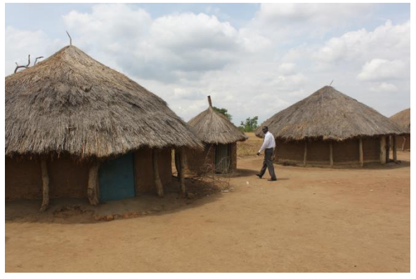
lowered their absenteeism.

Teachers improved their teaching methods; they gained more tools to teach with which in return benefitted the pupils. Many of them now stay in teachers' houses close to the schools, due to the increased participation of the parents that have built the houses for them. That means that they are closer to school, which has reduced their tardiness in coming to school and