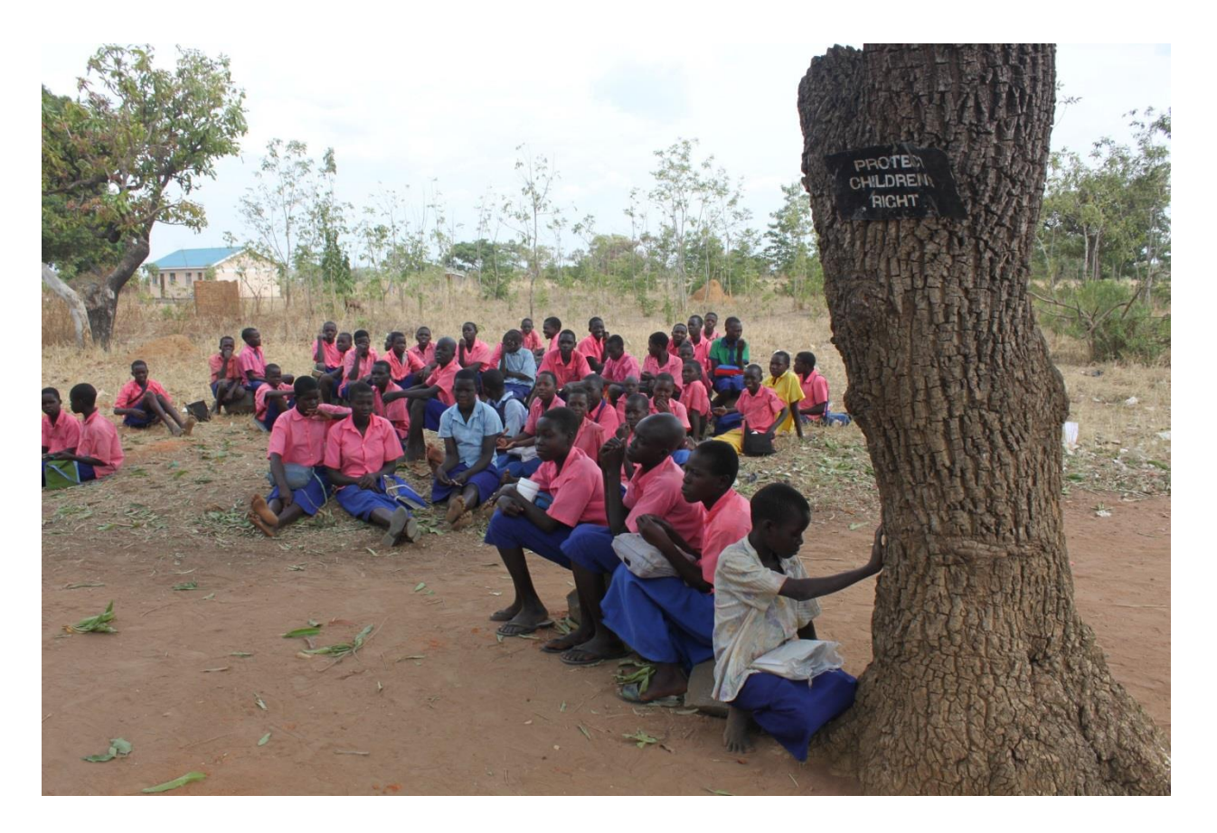
Final Evaluation Report

Education for Children Affected by Armed Conflict in Pader and Agago Districts, Northern Uganda, 2007-2013