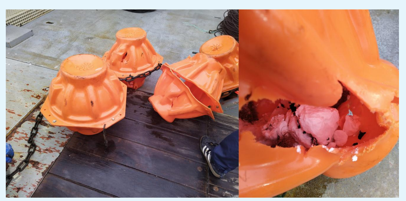
Figure 2. The deep glass flotation on mooring NWNM. Three glass buoys were destroyed leaving only the plastic cover. Probably they have imploded (the opposite of explode) turning the hard glass into a white powder. The flotation had been deployed at a depth of approximately 2400 meters, but they should be able to resist the pressure at up to 6000 meters.

The work north of the Faroes was now completed and we set course for standard section R west of Mykines. Section R was occupied from the Faroes and westwards and we continued with CTD stations along the Ridge until we reached the location of ADCP moorings IFRD and IFRE. These two moorings were recovered in the afternoon on Saturday 22/05. We