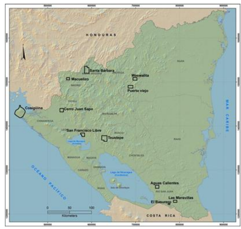
Map of Nicaragua showing geothermal areas visited by MEM Geothermal Group for reconnaissance purposes since 2010.

geochemical analysis covering also validation and accreditation for the GeLab. Studies on market needs were delayed from 2008 to 2011 due to various (Fridriksson reasons 2012b). The results of the marketing study indicated a need for the GeLab services (Sandino, 2011).