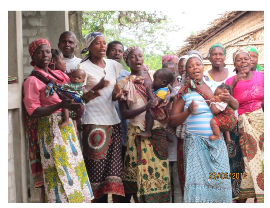
Photo 3: Adult literacy learners in Madonga Village welcome visitors

Even if the outputs and activities that have been discussed in this chapter so far have clearly contributed to improving access to adult education in Jangamo District, it appears to have had little or no impact at all on increasing the number of learners or improve the retention of them. In 2008, 2,778 literacy students were enrolled in the ALE Program in Jangamo District (Farinha 2009a: 27-28). In 2009, the number of learners was 2,642 and in 2010 the Program registered 2,280 learners (2,134 completed the year and 1,993 passed the exams). In 2011, the retention of learners appears to have declined somewhat again, with 2.490 learners registering in the Jangamo ALE Program and 2,128 completing the year while 1,871 passed the exams<sup>10</sup>. These numbers show that although the number of students registering in the ALE Program in Jangamo improved slightly last year (compared to the previous year), the registration and retention of literacy learners has been on the decline over the last few years. However, the pass rate seems to have increased from 65.4% in 2008 (Farinha 2009a: 28) to almost 88% pass rate in 2009, 93% in 2010 and back to almost 88% in 2011 (ICEIDA/MINED 2011a).