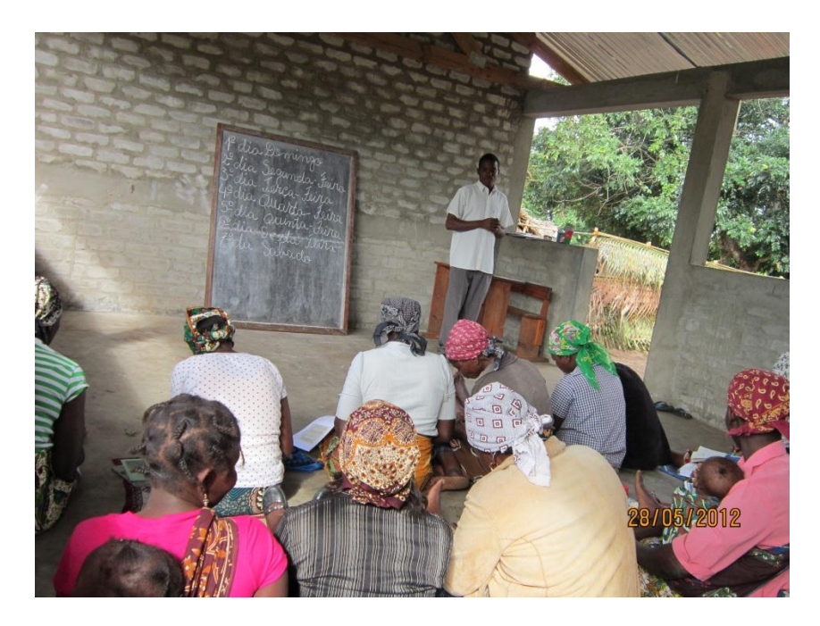
Photo 2: Newly built ALE shelter in Madonga Village, Jangamo District

Our assessment is that, the need to improve the physical infrastructure of the ALE Program in the communities in Jangamo District has certainly been addressed by the Partnership and, as pointed out above, in some cases exceeded annual plans. It seems, however, short of achieving stated target of "at least 80% of ALEC in Jangamo operating under a shed by the end of 2010" (ICEIDA/MINED 2010a: 30), which perhaps is a sign of too ambitious/unrealistic targets rather insufficient effort.