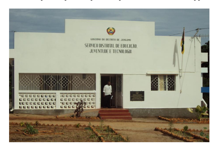
Photo 1: The new SDEJT office building in Jangamo inaugurated in April 2010

A great emphasis has been put on strengthening the capacity of the Jangamo SDEJT during the lifetime of the ICEIDA/MINED Partnership (SDEJT 2008; ICEIDA/MINED 2009; ICEIDA/MINED 2010b; ICEIDA/MINED 2011a; ICEIDA/MINED 2011b; ICEIDA/MINED 2012). A new SDEJT office building was built in Jangamo Town in 2009 which accommodates the entire staff of Jangamo's SDEJT. The office facility was duly equipped with office furniture, computers, photocopier and provided with office supplies.