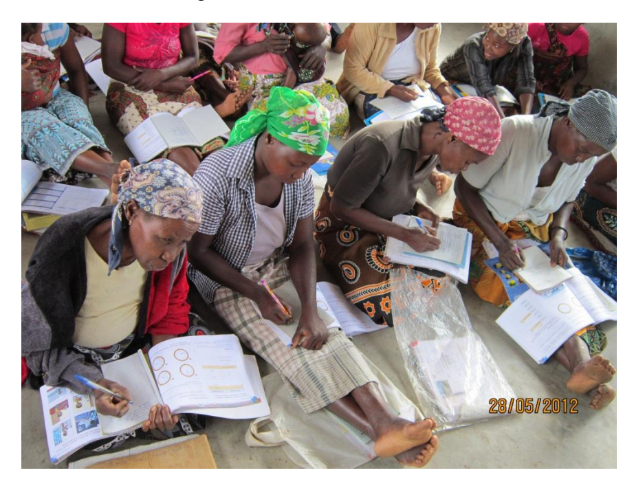
Photo 8: ALE learners making good use of their text- and exercise books

ALE Centres he coordinates, but had not received anything for year 3. Some of the coordinators had received the new teaching manual to give to the literacy teachers only the week before our consultation but had not received books for learners yet. In a similar vein, some of the literacy teachers had recently received the teaching manual for the new Curriculum while others have not yet received anything. All of them had had to start teaching this year without the new teaching manual.