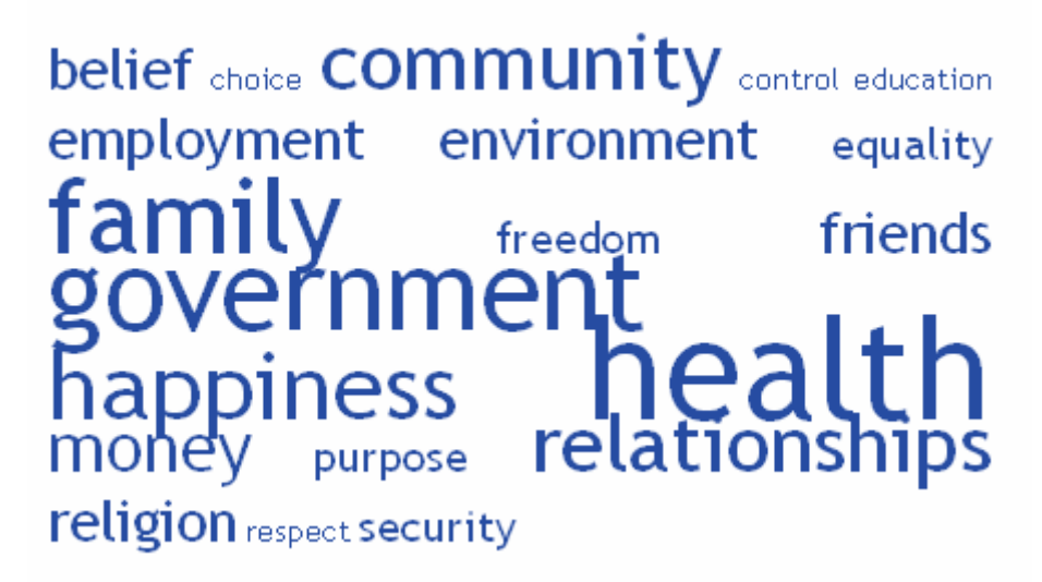
Figure 1 Commonly used words in the national well-being debate